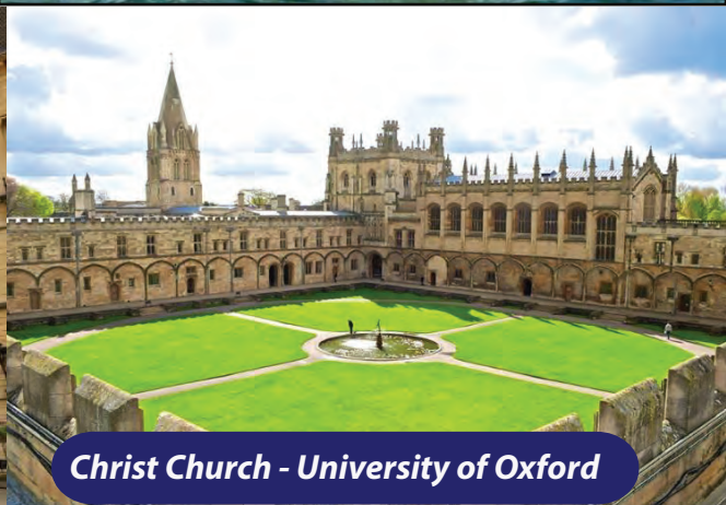
Christ Church - University of Oxford