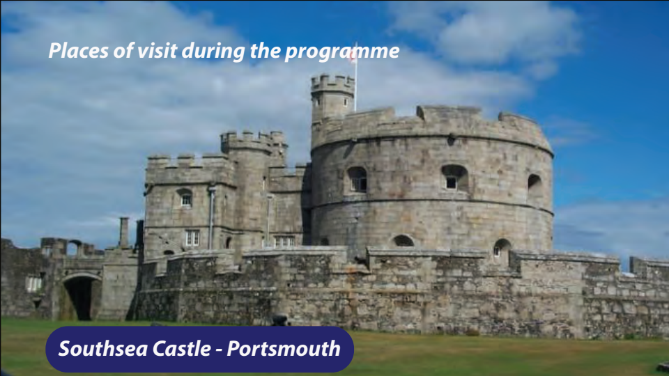
Southsea Castle - Portsmouth