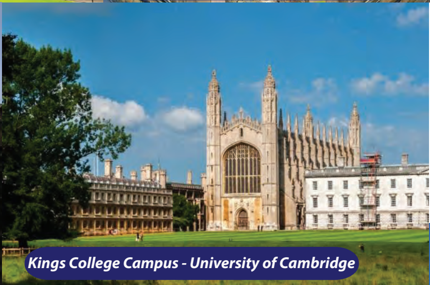
Kings College Campus - University of Cambridge