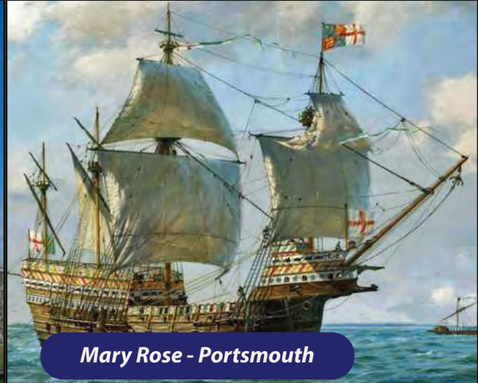
Mary Rose - Portsmouth