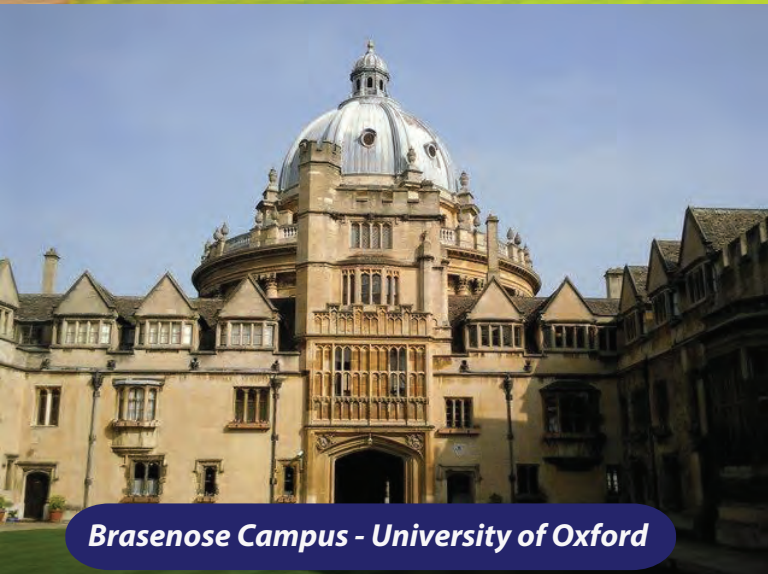
Brasenose Campus - University of Oxford