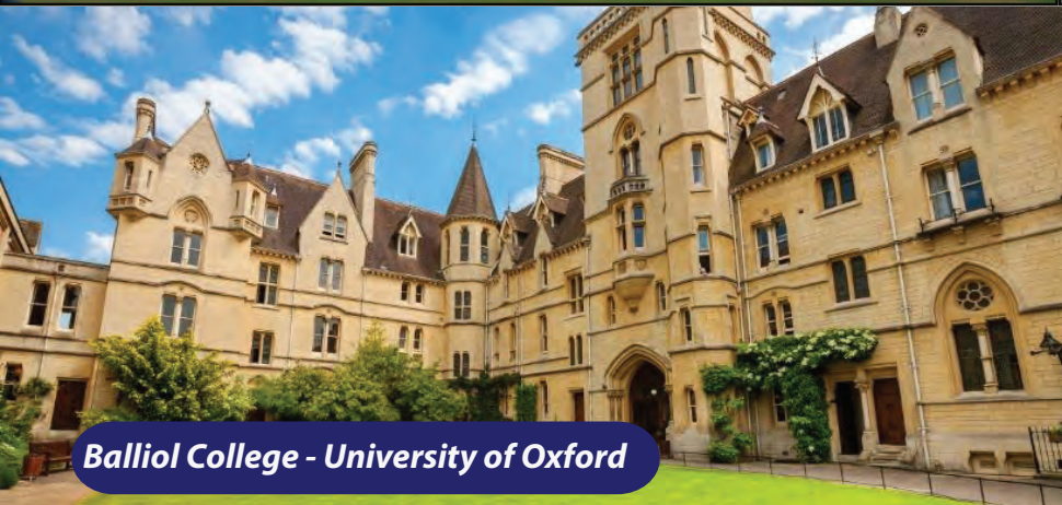
Balliol College - University of Oxford